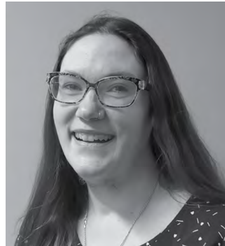
Award, along with the annual

The Mary Donaldson Award of Merit was established in 1977 to recognize library technicians and the essential services they provide in Saskatchewan libraries. The Mary Donaldson Award of Merit is given annually to a student who is enrolled in or graduating from a library and Information Technology (LIT) Program offered in Saskatchewan. The Mary Donaldson